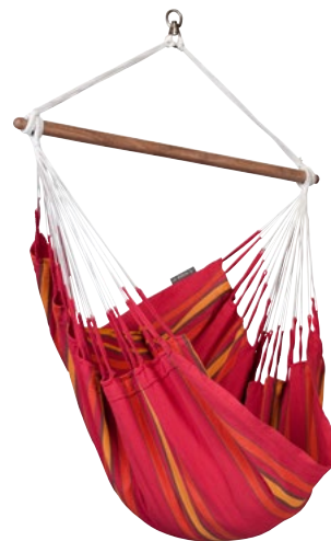
Hammock chair basic Currambera cherry CUC14-2